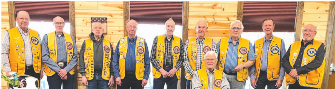
Several members were recognized by the Stanley Lions club for perfect attendance.