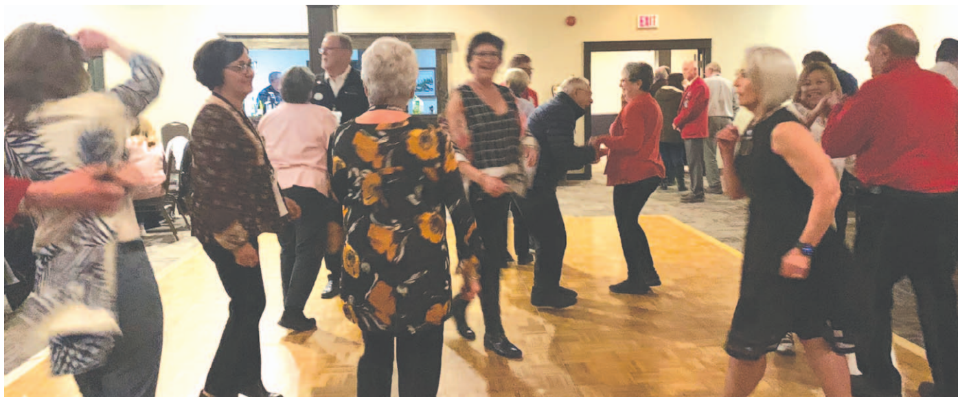
Lions dance to the Bromantics