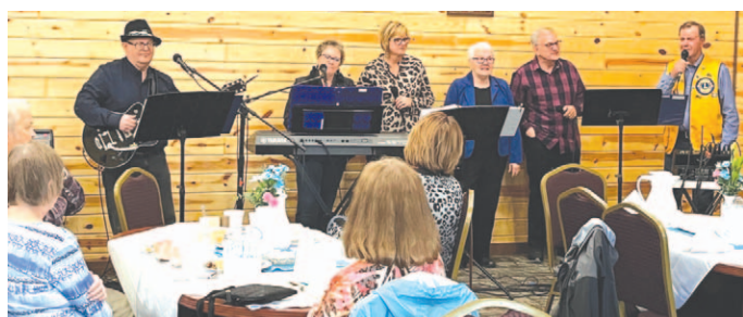
Stanley Lions held their Ladies night on May 9th with a great meal and wonderful entertainment by the Replacements.

ND Lion deadline is the 7th of the month!