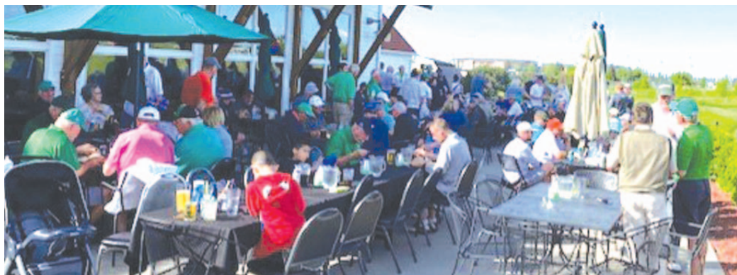
Steak dinner following the event.