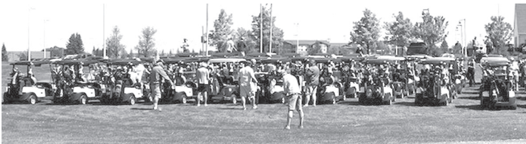
Golfers ready for the start.