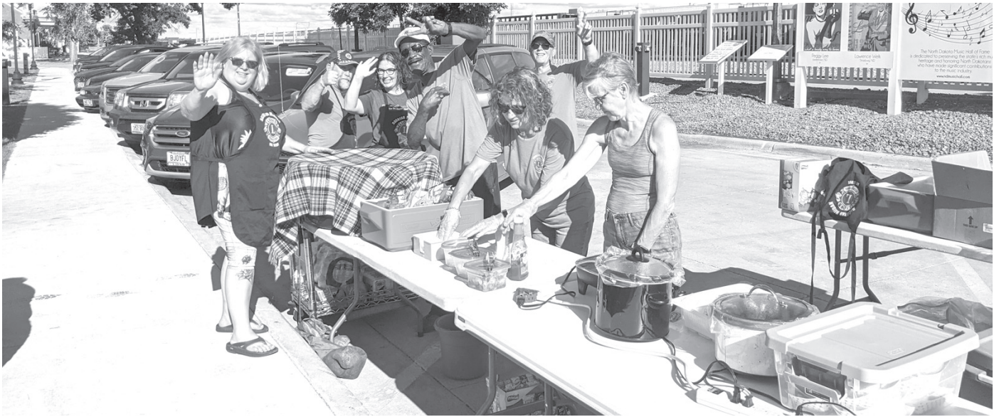
Dacotah Mandan Lions Club serve their community with burgers, brats and hotdogs every Tuesday night throughout the summer. We serve between 5:30 and 7:30 pm at the Dykshoorn Park on West Main Street in Mandan, ND. Come join us!