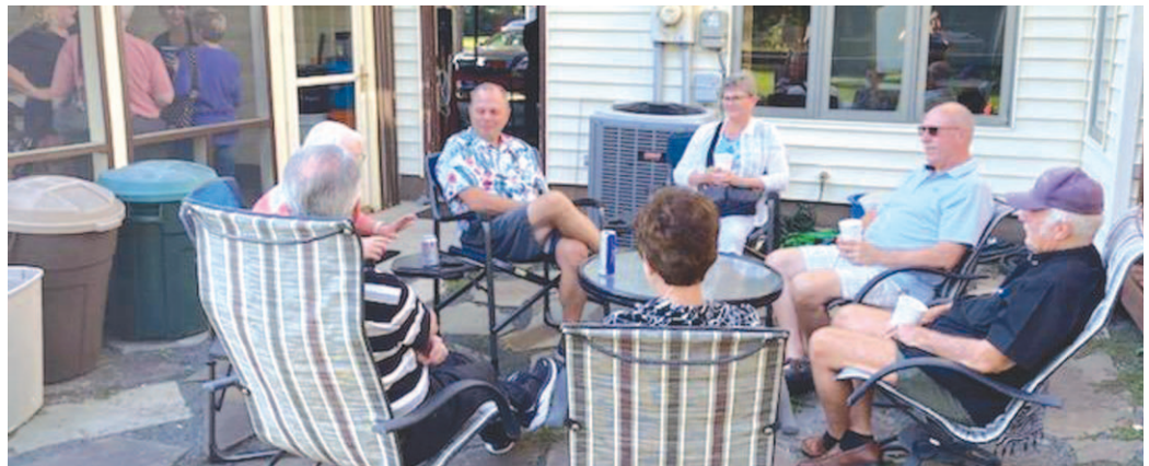
A few participates of the Gateway Lions Club picnic in good conversation before they got to eat some of the delicious food.