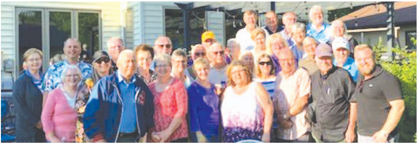
Everyone that was present at the first annual summer/membership picnic of the Gateway Lions Club.