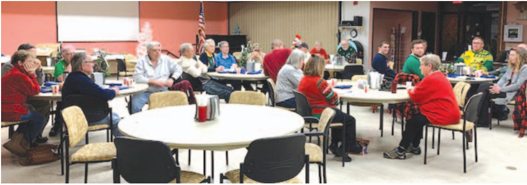
The Korner Lions celebrate at a Christmas party with games, singing Christmas carols, awards and a unique Christmas sweater contest.