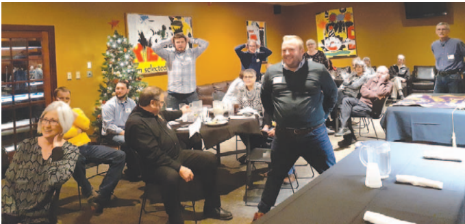
Gateway Lions Club member enjoying a game of "Heads" or "Tails" at their mid-year social.