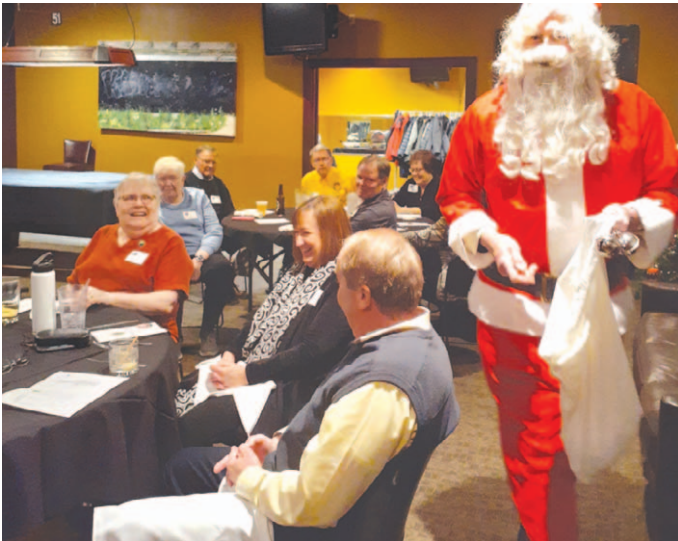
"Santa" spreading his joy at the Gateway Lions Club mid-year social.