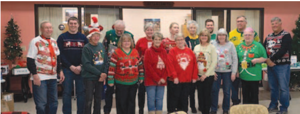
Korner Lions show off their Christmas sweaters.