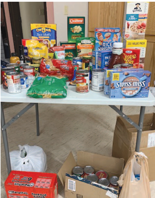
The Korner Lions collected nonperishable food items at the annual Christmas party that were donated to the Gloria Dei Church food pantry.