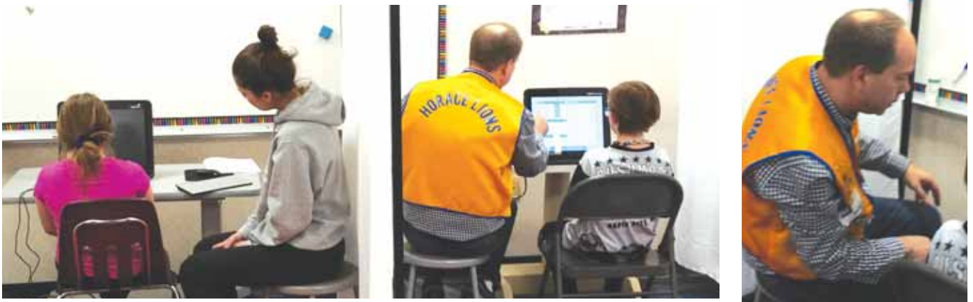
The Horace Lions recently conducted RightEye screening of most students in the Horace Elementary school. Over 225 students in Grades K - 5 were screened over a three day campaign. RightEye screening uses a computer screening method that measures the interaction between the eyes and brain.