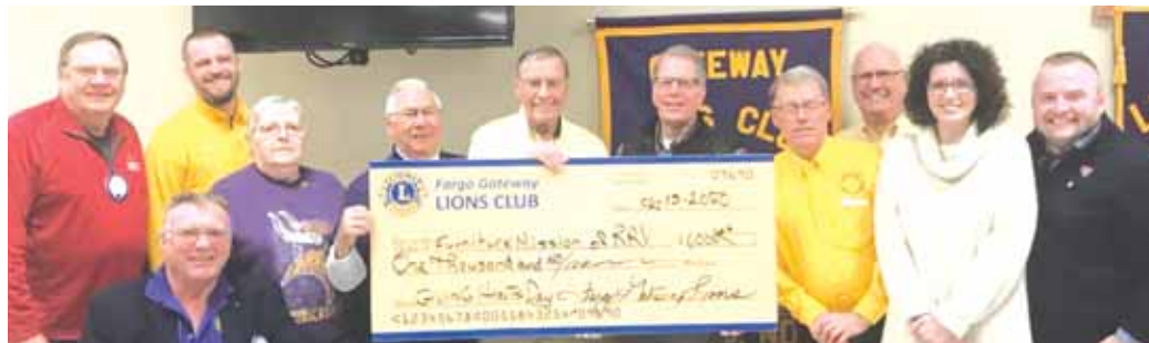
Pictured above are some members of the Gateway Lions Club of Fargo as they are shown presenting Furniture Mission of the Red River Valley a check for $1,000.