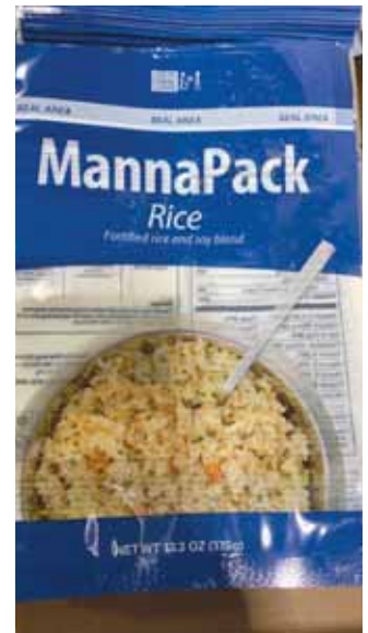
11, 736 of the MannaPack rice packages were filled with rice, soy, vegetables and vitamins in the 3 day event. One package contains 6 meals so that is 70,416 meals..