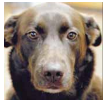
Scooby, awaiting a companion service dog at Luther Memorial Home, recently turned 13 years old.