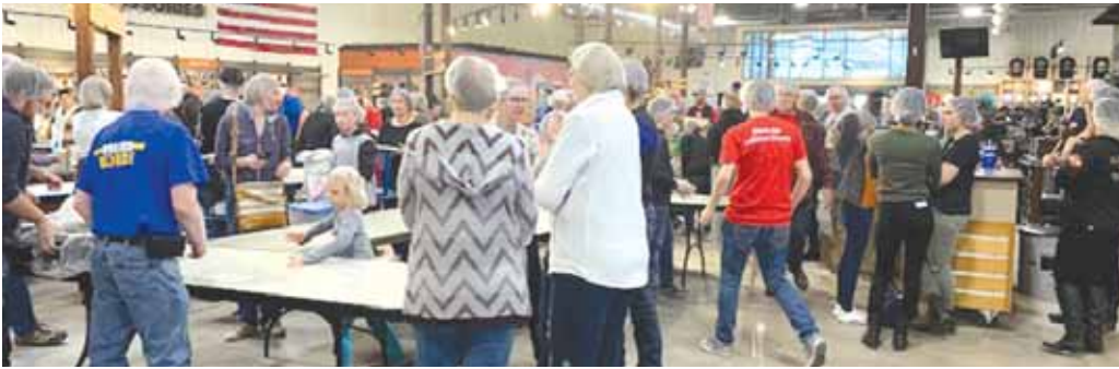
The Feed My Starving Children event was held at the Williston Harley Davidson store. Shown are some of the many volunteers who assisted over the 3 days.