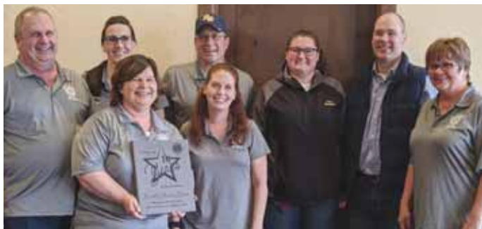
The New England Lions Club presented the South Heart Lions Club with a plaque commemorating their 10 year Anniversary as a Lions Club. The New England Lions Club sponsored the South Heart Lions Club.