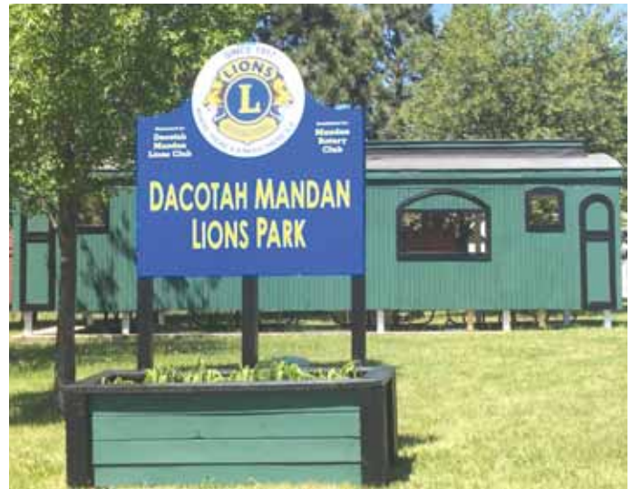
Dacotah Mandan Lions Centennial Sign with ND State Railroad Museum Park flower bed and shelter.