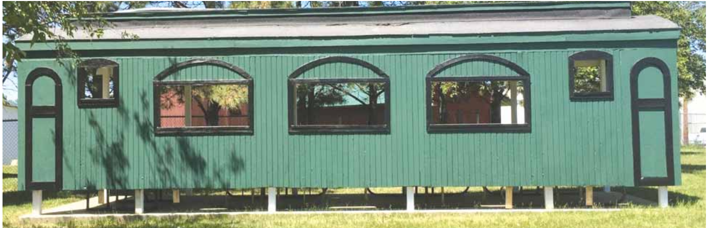
Dacotah Mandan Lions maintain the ND State Railroad Museum Park as one of their service projects for the community. ND State Railroad Museum Park shelter is ready for visitors!