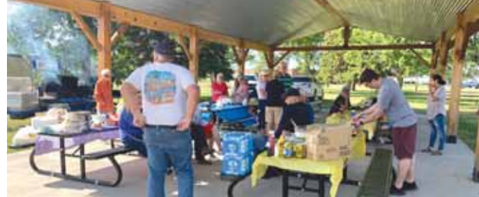
Korner Lions enjoy some fellowship at their annual awards picnic in June.