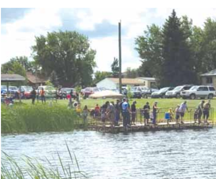
Glenburn Fishing Derby - dock