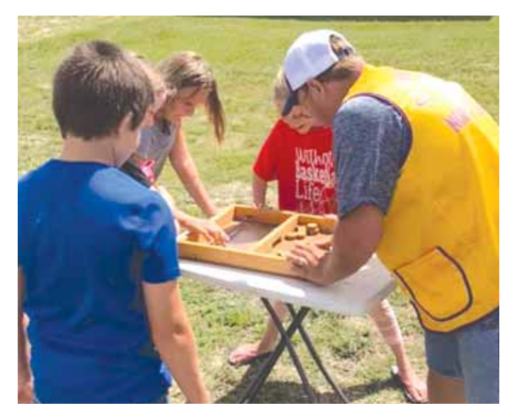
Glenburn Fishing Derby - game