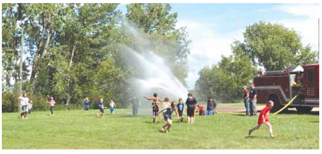
Glenburn Fishing Derby - fire truck.

Glenburn Lions did an awesome job of hosting and organizing "Fun Day Sunday" - a Kids Fishing Derby at the Glenburn pond on July 19, 2020. 45 children (and their parents) had a great time with fishing, outdoor games, face painting, and getting sprayed by the Fire Truck. They also enjoyed hot dogs & hamburgers, and received donated prizes. The local Park Board assisted with serving the meal. Prizes were donated by Glenburn and Minot businesses - every child who attended received at least 2 gifts. Kudos to the local fire chief for spraying the kids with the fire truck. It was a beautiful day with an