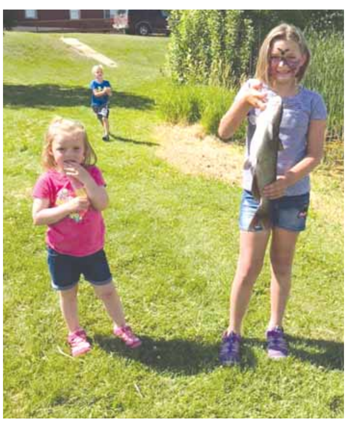
Kids with fish. More pictures on page 4