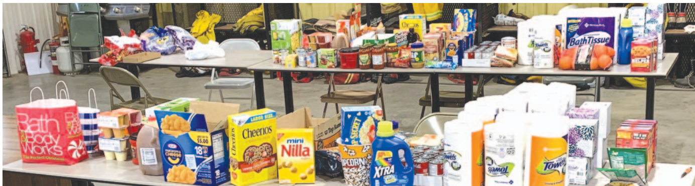
Food items purchased to be donated to various pantries.

The South Heart Lions Club purchased food for local families and food pantries. The South Heart Lions heard about the needs in the community and decided to purchase $100 worth of food items for a couple of families to help out over the holidays. Donations were received from the club members that assisted with the cost of the items. The total raised was $740 for the service projects.