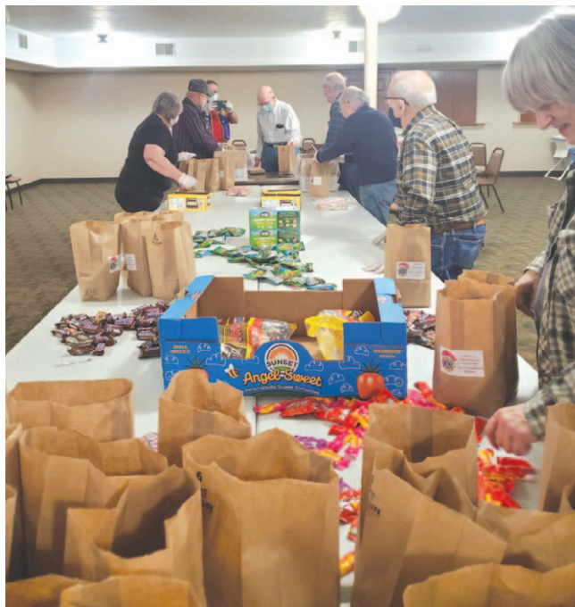
New England Lions filling candy bags, while observing mask and distancing guidelines.

The New England Lions typically bag candy for Santa to give children after the New England Public School Christmas Concert. Several hundred children have the opportunity to sit on Santa’s lap, have a picture taken with Santa, and get their bag of candy and peanuts.