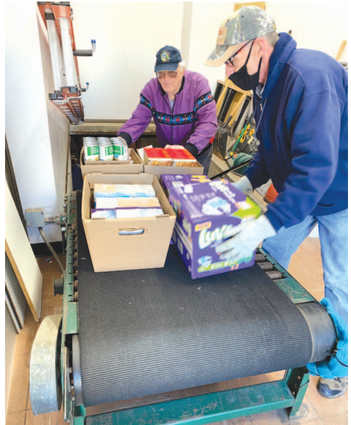
Lions unload food at Aid Inc.