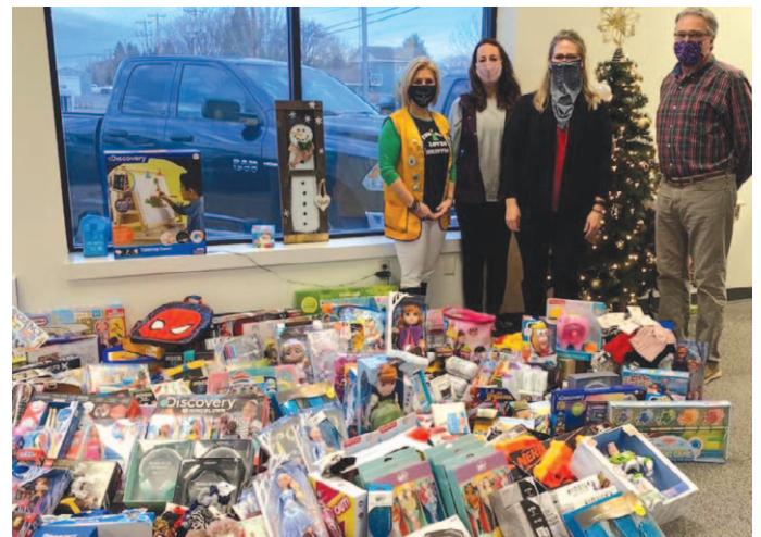
$5000 donation for gifts for Minot Area Homeless Coalition and Community Action