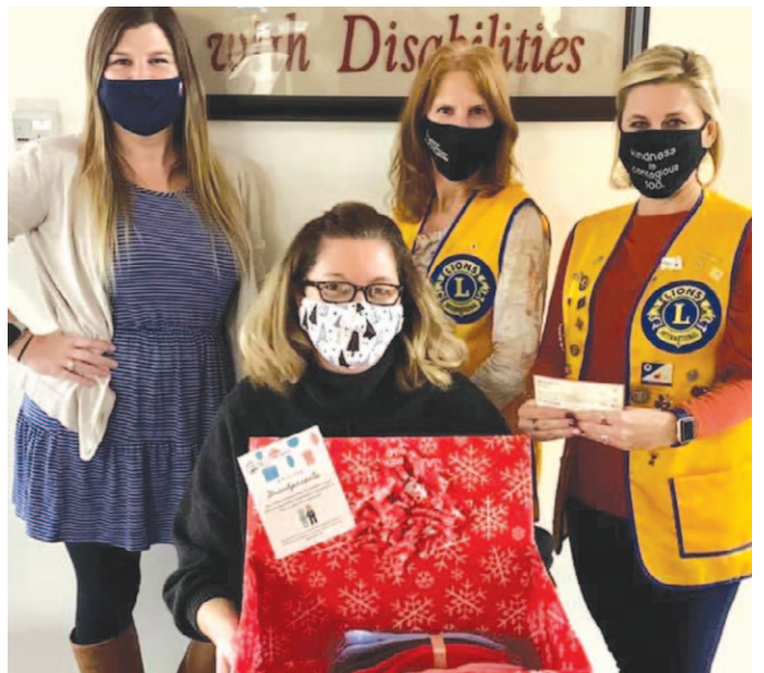
$500 donation to Gifts for Grandparents through ND Center for Persons with Disabilities.