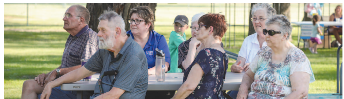
Community members listening to speakers.