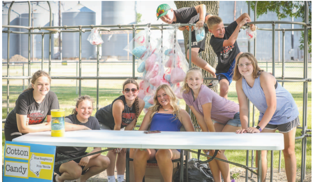
Local children selling cotton candy.

The next phase of the Sunset Park Revitalization Project will be completed this summer which includes off-street parking, walking paths for exercise and better accessibility throughout the park. LaMoure Lions will now be assisting the LaMoure Park Board in raising funds to support a badly needed new pool. The future is looking bright at Sunset Park!