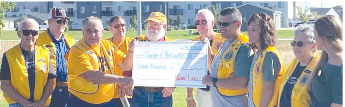
Members of the club are shown presenting a check for $15,000.00 to founders of the garden.