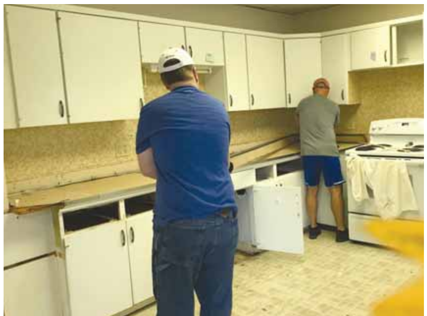
Glenburn Lions volunteer by removing wallpaper and removing kitchen cabinets as part of the Glenburn Senior Citizens kitchen remodel project.