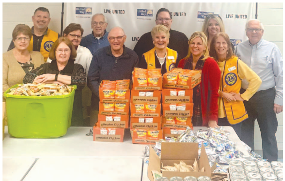
Packing meals for local elementary students with the Backpack Buddies program.