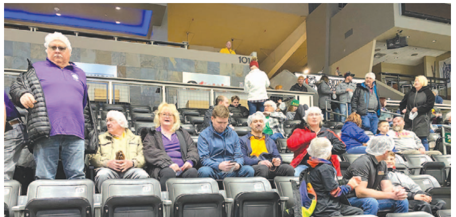
Some of the 16 Gateway Lions Club members that were at the Scheels Arena for the "FEED MY STARVING CHILDREN" event as they wait for instructions.