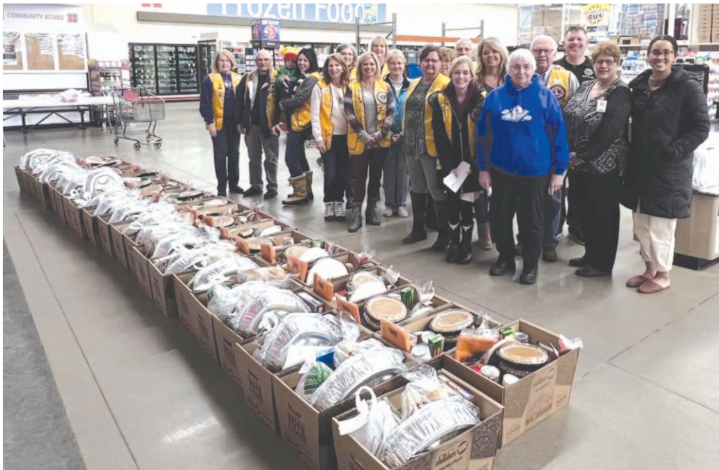
Pictured are the annual Thanksgiving Day baskets donated to Minot Community Action. We purchase and assemble all the baskets at Cash Wise Foods then go around and deliver them before the holiday.