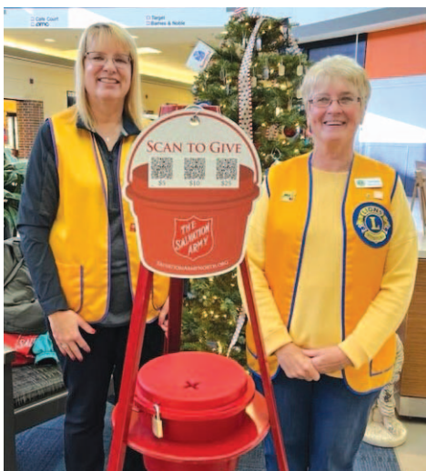
Ringling bells at the mall for our local Salvation Army.