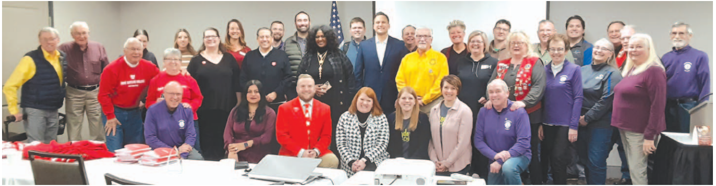
Members of the Gateway Lions Club and a representative from 17 organizations during the annual Pre-Giving Hearts event. During this event the Gateway Lions Club gives each of the organizations a donation.