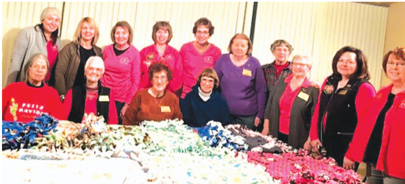
The Bismarck Prairie Rose Club members pictured made fleece tie blankets at a recent club meeting as a winter service project. Nine fleece blankets were donated to the Abused Adult Resource Center in Bismarck.