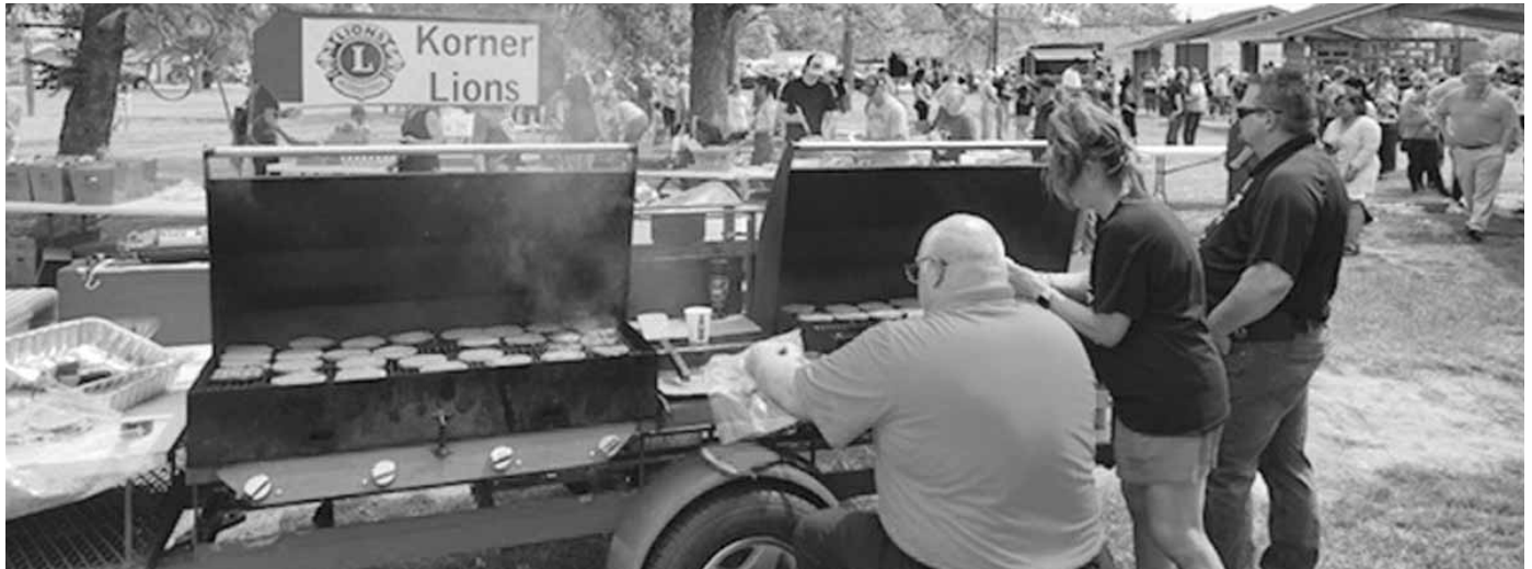
The Korner Lions assist School Dist. 7 in a picnic for their staff appreciation lunch at the end of the school year. Thank you to the Lions Foundation of North Dakota for the matching grant to refurbish the grill which allows the club to continue to serve in the community.